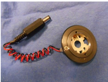
STOE sample holder insert with battery clamp (coin cell not mounted)

Once started at the synchrotrons, the structural in situ analysis of electrode materials during a charge-discharge cycle in battery cells using X-ray diffraction became more and more popular.